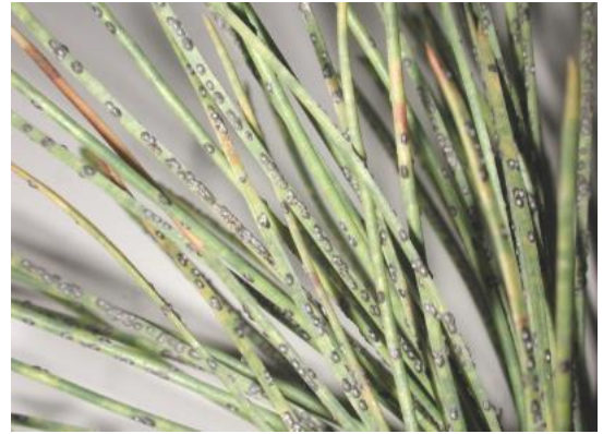
Black pineleaf scale on Austrian pine

Scale insects look different from the typical insects we generally encounter. Many people do not recognize these scales as insects, because they are usually small, immobile, and have no visible legs or antennae. Scale insects attach themselves to the host plant, insert their mouthparts into the vascular system for feeding, and then cover themselves with a waxy shell or scale. The outside hard scale cover protects the insect as it feeds on the host plant.