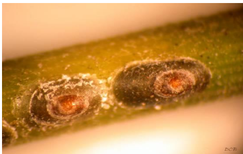
Black pineleaf scale greatly enlarged

Biology: Although the black pineleaf scale life cycle has not been studied in Utah, studies of this insect have been conducted in Colorado. Insect development in Utah should be similar to Colorado. The insect generally over-winters as a partially developed scale. Eggs and immature nymphs (crawlers) likely appear in June or July, depending upon temperature. If there is a second generation, egg hatch and crawlers may appear again in late summer. Crawlers move around on the needles or tree bark for several days before permanently settling down on the needles to feed. After egg hatch, the crawler stage and very young scale insects are the life stages most susceptible to control measures. Crawlers usually insert their mouthparts and begin to feed along the flat inner surfaces of young needles. Once they begin to feed the crawlers secrete a waxy covering that enlarges with subsequent molts to accommodate their growth. The black pineleaf scale covering is generally grayish black with a lighter colored spot in the center of the scale. This covering differentiates this insect from another common scale on pine, the pine needle scale Chionaspis pinifoliae , which has a uniformly narrower and whitish covering.